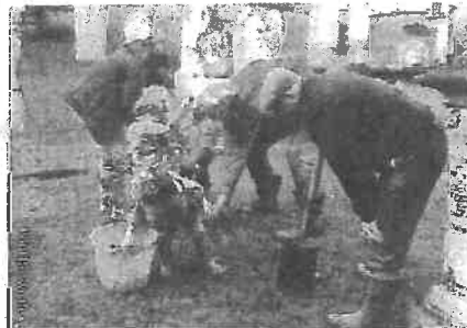
Crocus planting at Torteval Church, Guemsey involving Rotary, the local Bloom group and Torteval Pre-School

Y ou will have seen in the Spring Issue of Grass Roots that, as part of Greening Grey Britain for Health and Happiness, the RHS is partnering with Rotary International in support of their 'Purple4Polio' campaign to end polio by planting 5 million Crocus tommasinianus across the UK – and it's time to get involved!